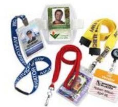
Cards & Access