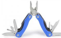
Tools & Gadget