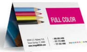
Business Cards & Calendar